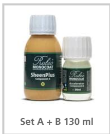
Set A + B 130 ml