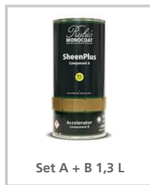
Set A + B 1,3 L