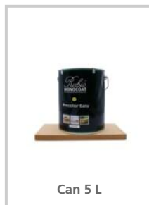
Can 5 L