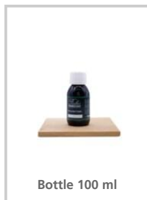
Bottle 100 ml