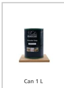
Can 1 L