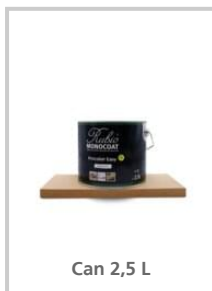
Can 2,5 L