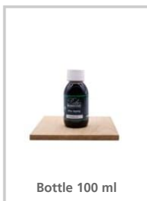
Bottle 100 ml