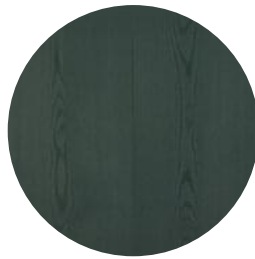
RUBIO MONOCOAT GREEN