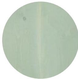
SALT LAKE GREEN