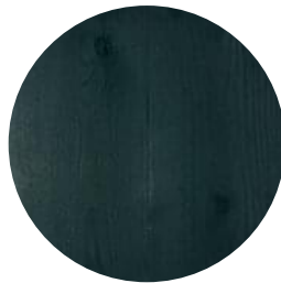
RUBIO MONOCOAT GREEN