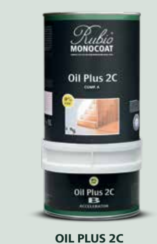
OIL PLUS 2C Linseed oil based on molecular binding Protects and colours in one layer