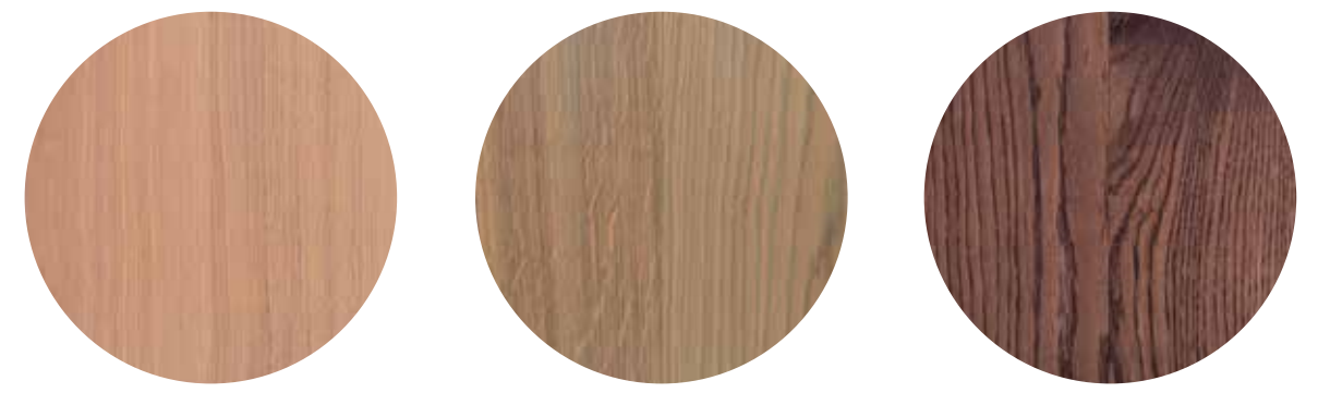
WINTER BLUSH FROST GREEN HEATHER PURPLE