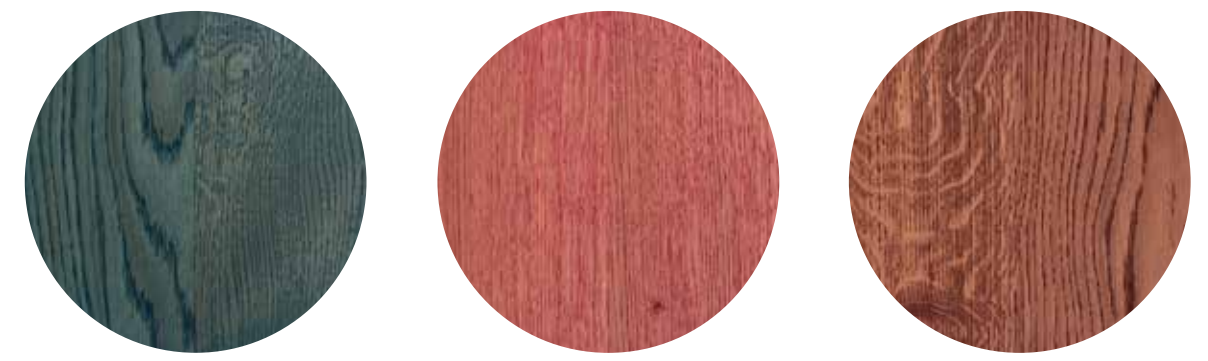
TEAL BLUE POMEGRANATE PINK RUSTY BROWN