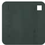
RUBIO MONOCOAT GREEN