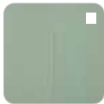
SALT LAKE GREEN